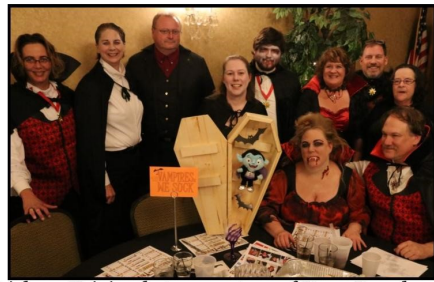
2019 Trick-or-Trivia